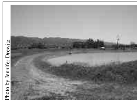
This pond north of Guinda illustrates one practice used to help catch winter storm runoff while simultaneously creating habitat for wildlife.

The YCRCD and many Capay Valley farmers and ranchers also work closely with the USDA Natural Resources Conservation Service (NRCS) to access federal, state, and local resources. These partnerships combine financial, technical, and skill resources to solve natural resource problems in a way that benefits both farmers and the environment. In the end, farming that sustains the environment is profitable and serves the interests of all involved.